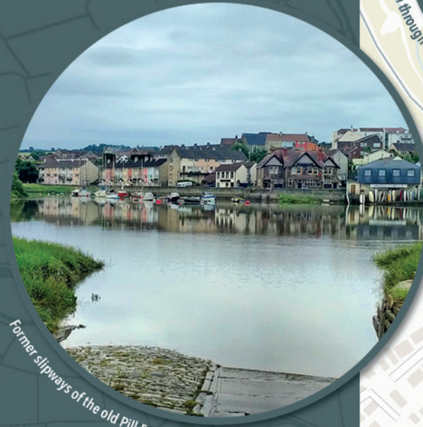
Former slipways of the old Pill Ferry, viewed from 'A'

When you get to the end of the reserve, nearly right under the bridge B , turn around and prepare for your journey back.