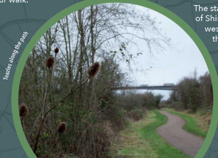
Teasels along the path