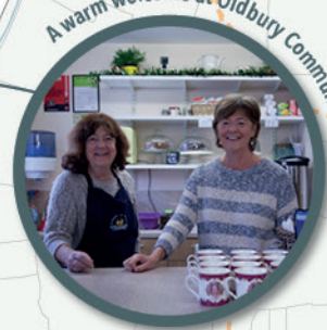
A warm welcome at Oldbury Community Shop