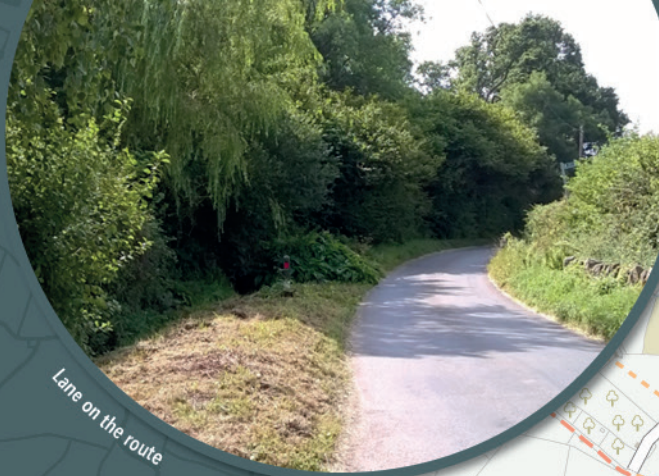
Lane on the route

You can rest here too, learn more about this Anglo-Saxon saint, and take in the wonderful views from her churchyard before heading back downhill to Oldbury. You can complete your tour of historic houses at The Anchor if you need refreshment!