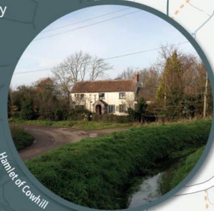
Hamlet of Cowhill