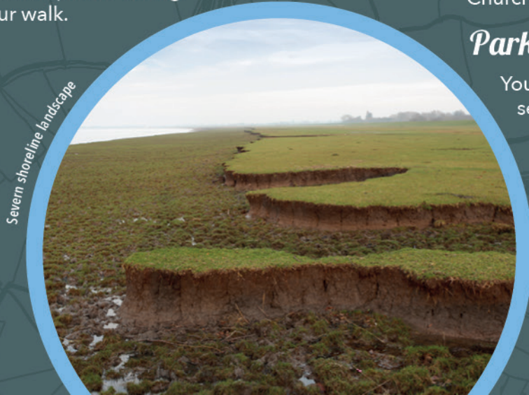
Severn shoreline landscape

Length: 7 km - about 2.5 leisurely hours