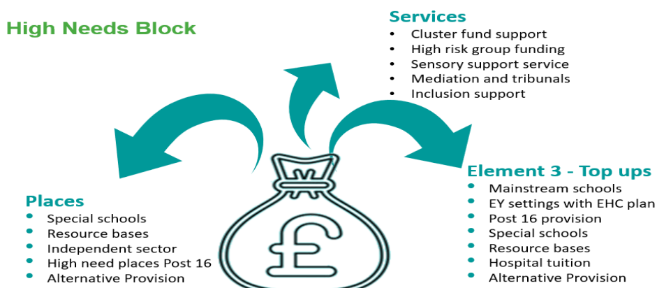
Figure 2 shows the totality of the High Needs Funding Block

The High Needs Block provides resources to pay for inclusion support services, specialist places and top-up funding. Decisions about spend in one area has a knock-on effect on resources available in other two areas. Partners in local areas should work together to ensure that there is a strategic agreement on the appropriate balance between spend on service, places and top-ups.